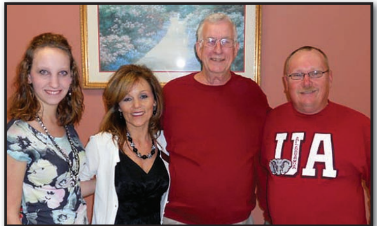
Open house at Chilton Medical Center.