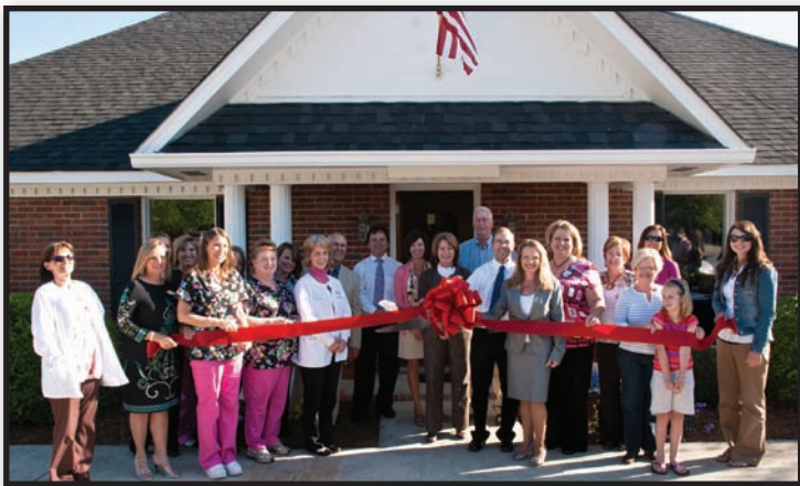
Ribbon cutting and open house at SouthernCare on Medical Center Drive.