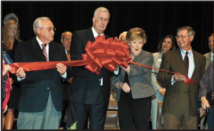
A ribbon tying ceremony was held at the Clanton campus of Jefferson State Community College to commemorate the opening of the new Economic Develop Center.